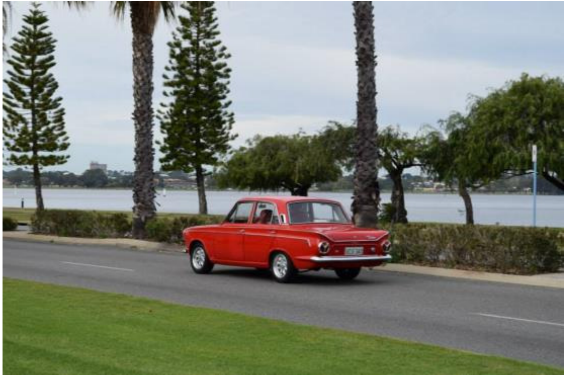
An iconic Mark I Cortina struts its stuff on the circuit