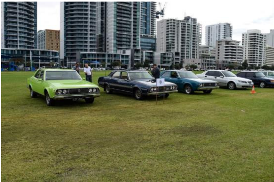
The Three Ps look at home beside their modern counterparts