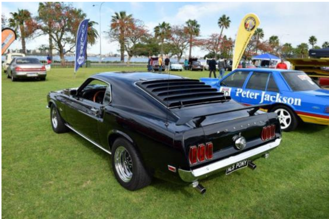
This Mustang is all muscled up and ready to rip.