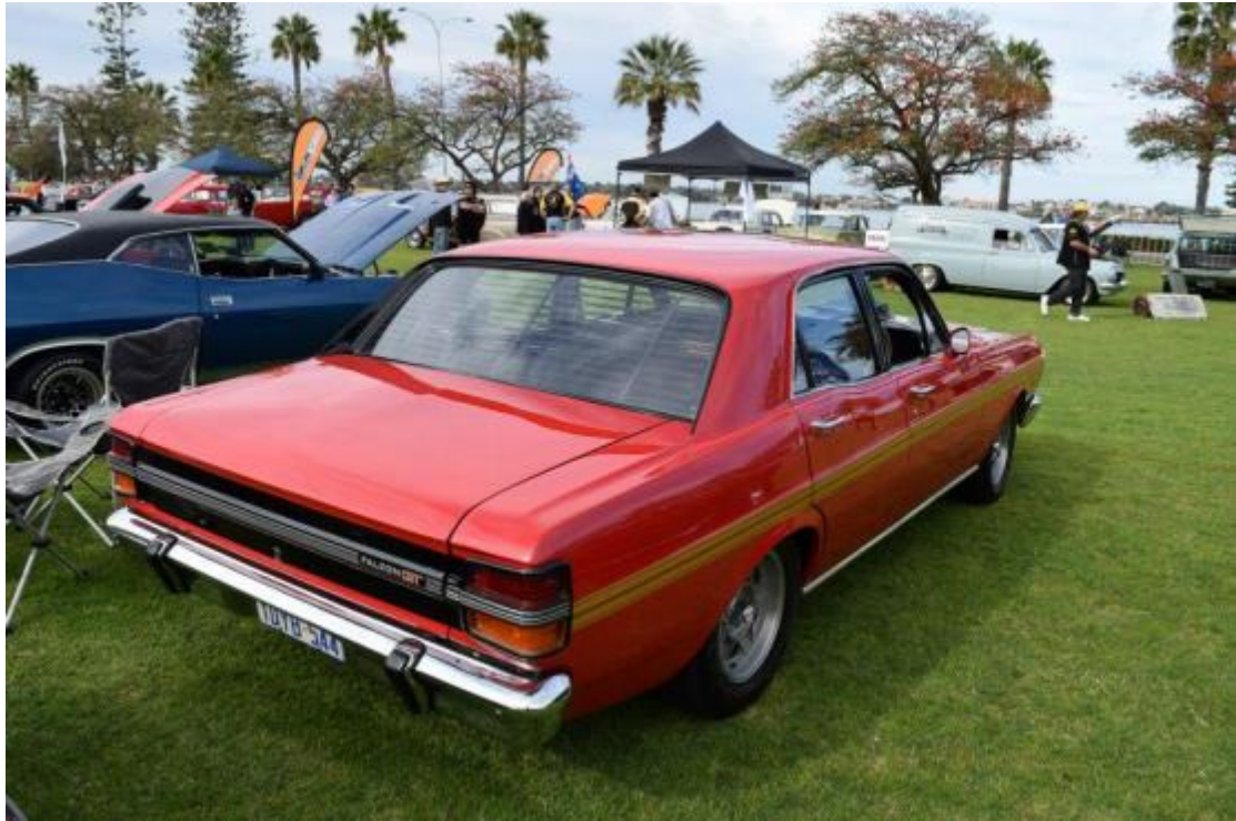
This fiery red GT Falcon surely packs a punch.