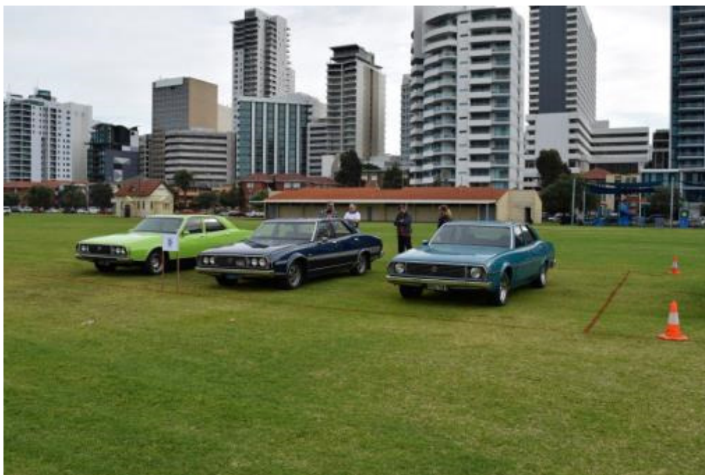
The Three Amigos make an early appearance at Langley Park