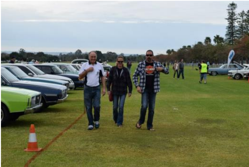
The P Team in action as the Park fills up

Several other car clubs had static displays so lots of car candy to look at and all in all, it was a really good event to be involved in and hopefully more will attend next year.