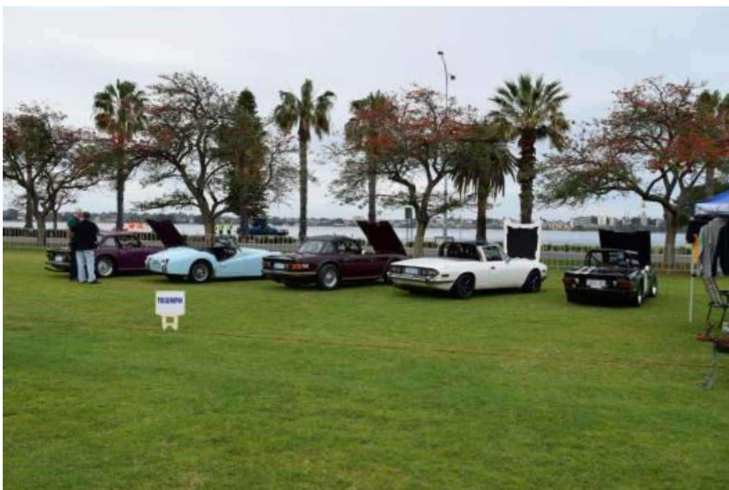
Triumph corner presents and impressive display of legends